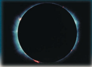
Total solar eclipse