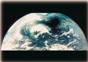
Sattelite image of a solar eclipse