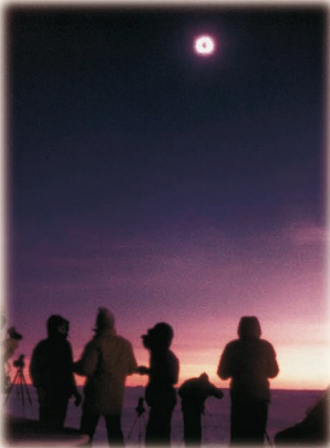
Scenery during eclipse totality