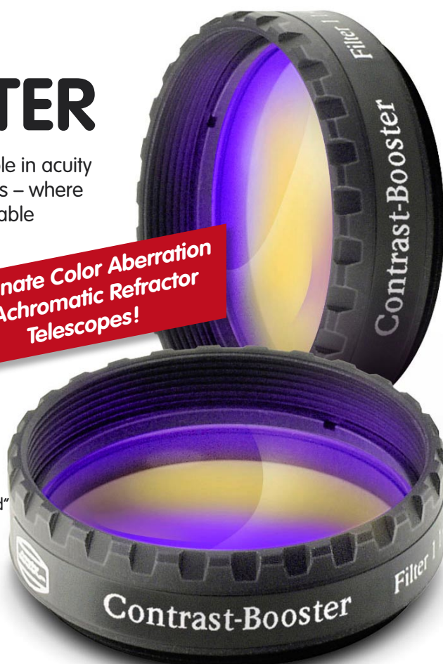
Interferogram BAADER Contrast-Booster

Eliminate Color Aberration in Achromatic Refractor Telescopes!